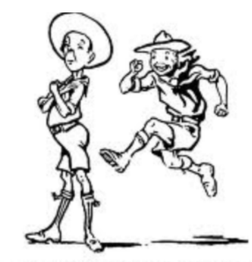
A Scout is active in DOING GOOD, not passive in BEING GOOD. It is his duty to be helpful and generous to other people.