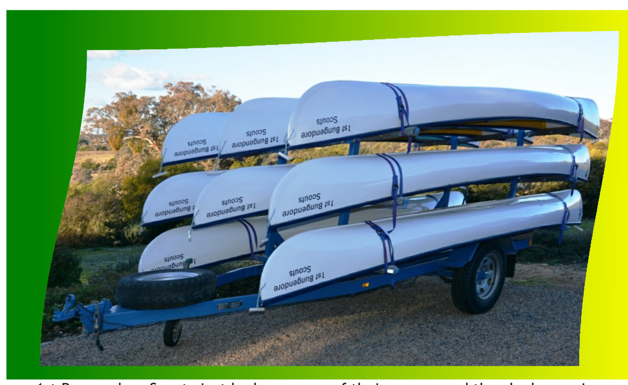
1st Bungendore Scouts just had a revamp of their canoes and they look amazing.